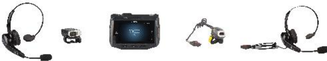
Figure 2: Zebra Total Wearable Solution Family

From Left to Right: HS3100 (Bluetooth) headset, RS6000 1D/2D Bluetooth ring scanner, WT6000 wearable computer, RS4000 1D ring scanner, and HS2100 (corded) headset.