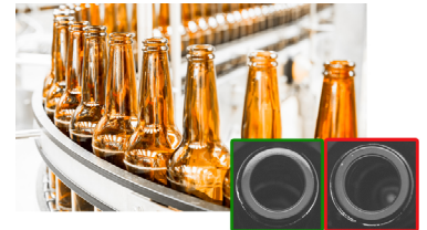
Image classification using deep learning categorizes images or image regions to distinguish between similarly looking objects including those with subtle imperfections. Image classification can, for example, determine if the lips of glass bottles are safe or not.